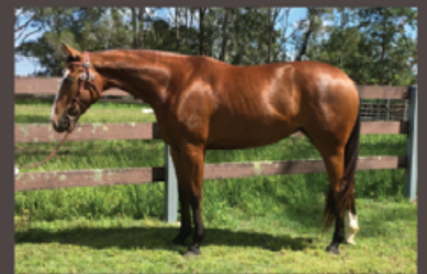
TOTAL PIRATE BLUE