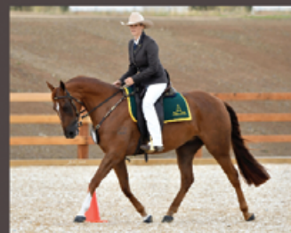
TOTAL NOTES AND LYRICS