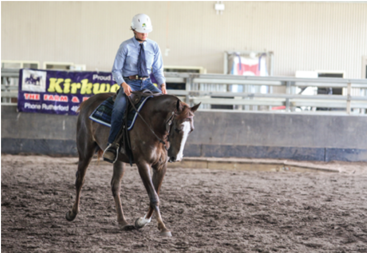
Tocal Texas Rose