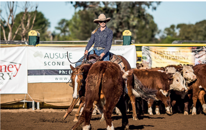
Tocal Kiss Me Chic