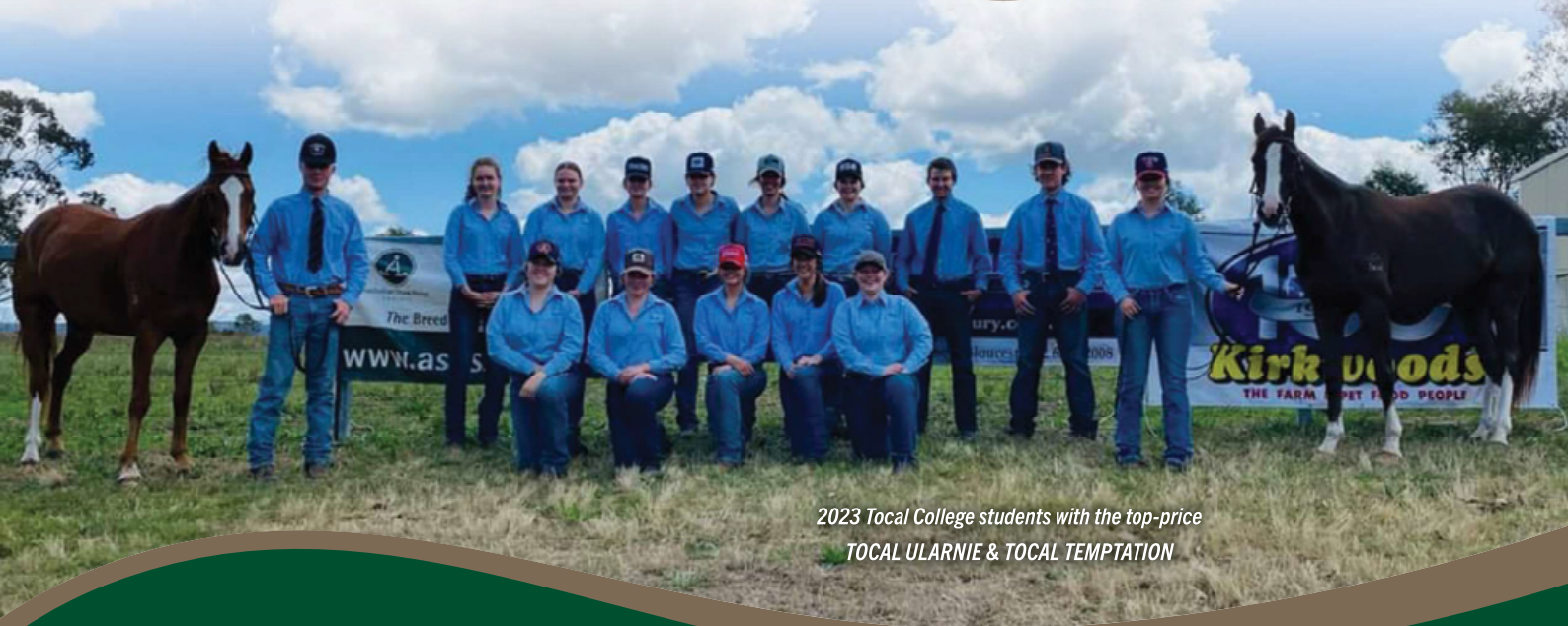
2023 Tocal College students with the top-price TOCAL ULARNIE & TOCAL TEMPTATION