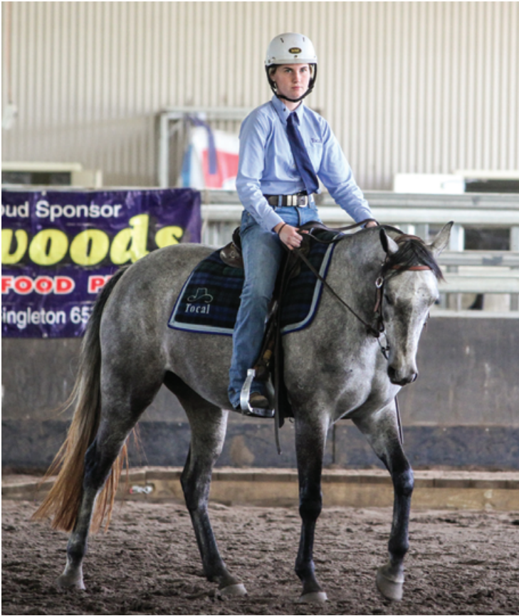
Tocal Top Shot