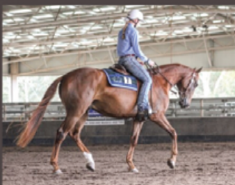
TOTAL QUIRKY KAT