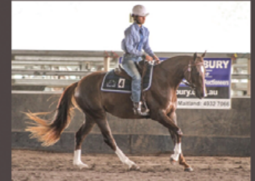
TOTAL QUALITY TIME