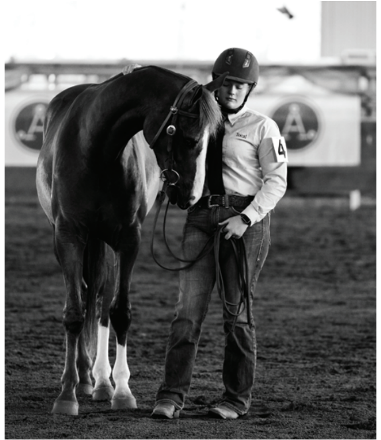
Tocal Top Secret