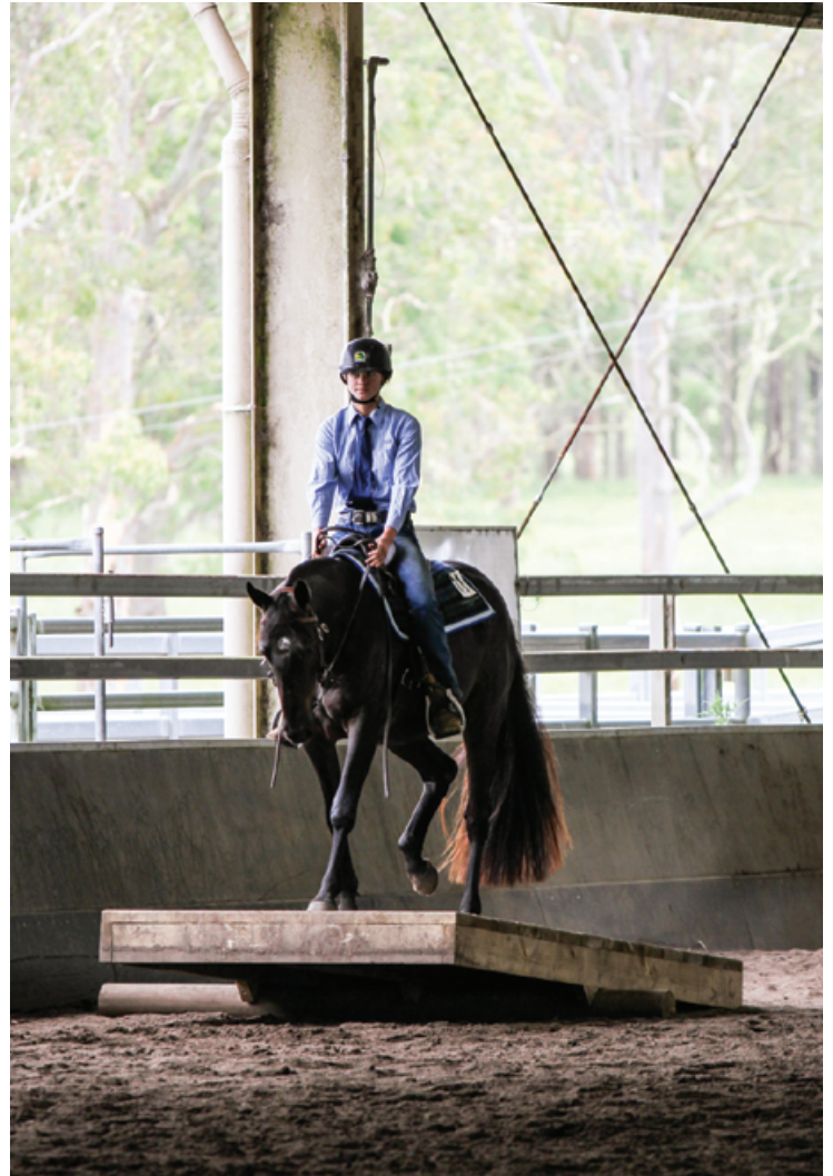
Tocal Two Step