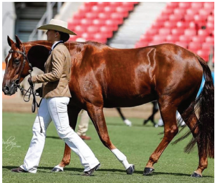
Tocal Notes and Lyrics