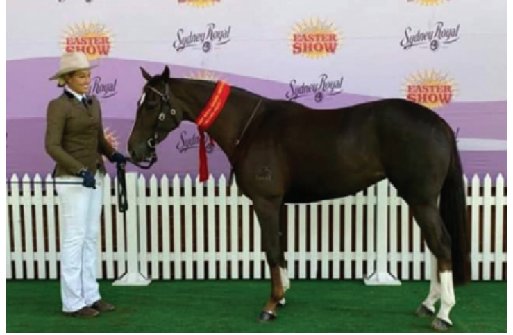
Tocal Quality Time