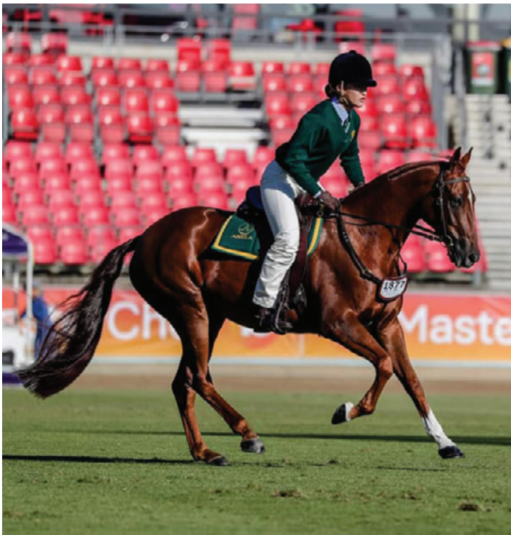
Tocal Notes and Lyrics