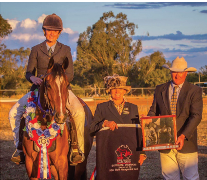
Tocal Looney Tunes