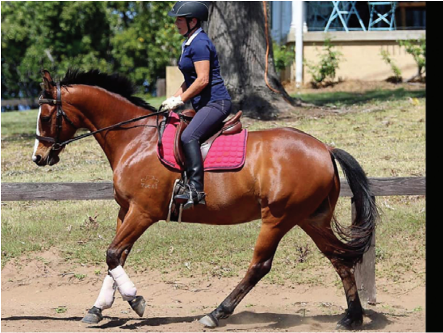
Tocal Let's Just Love